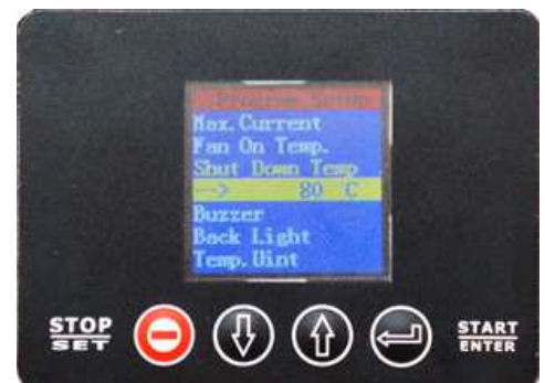
Picture 3 Program setup